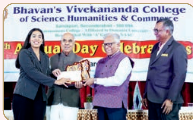
Felicitation of NCC Cadets