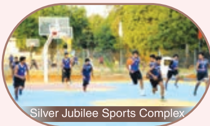
Silver Jubilee Sports Complex