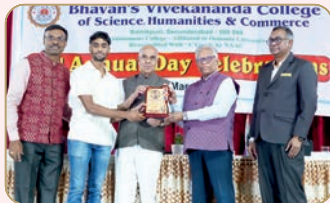
Felicitation of BVC Sportspersons