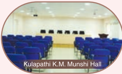
Kulapathi K.M. Munshi Hall