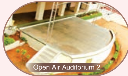
Open Air Auditorium 2