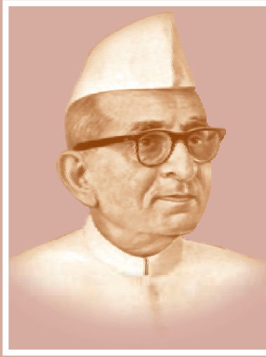
Kulapati Dr. K. M. Munshi