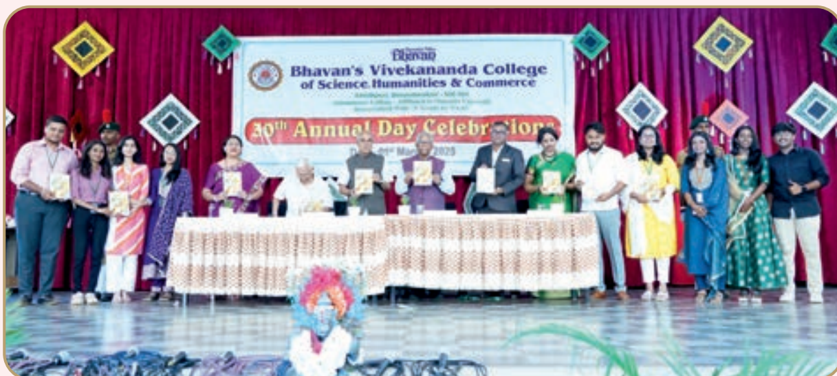
Release of College Magazine Vibha