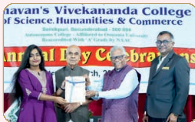
Felicitation of Toppers